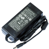
24V 2.5 A power adapter