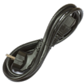
2 IEC cords