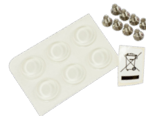
Fastening set for rackmount case