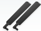
HGO indoor antenna