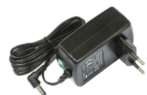
24 V 1.2 A power adapter included

IPsec hardware encryption (~470 Mbps) and The Dude server package is supported, microSD slot on it provides improved r/w speed for file storage and Dude.